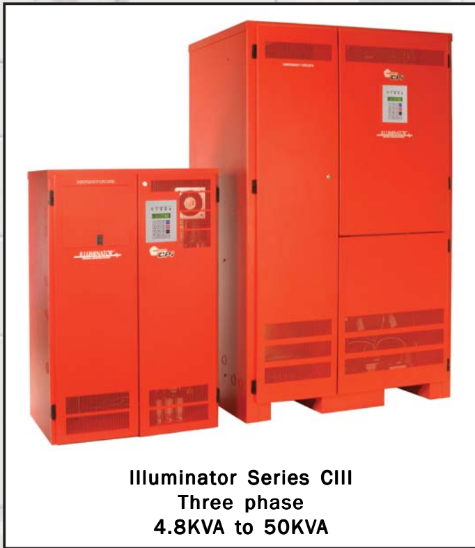
Illuminator Series CIII Three phase 4.8KVA to 50KVA