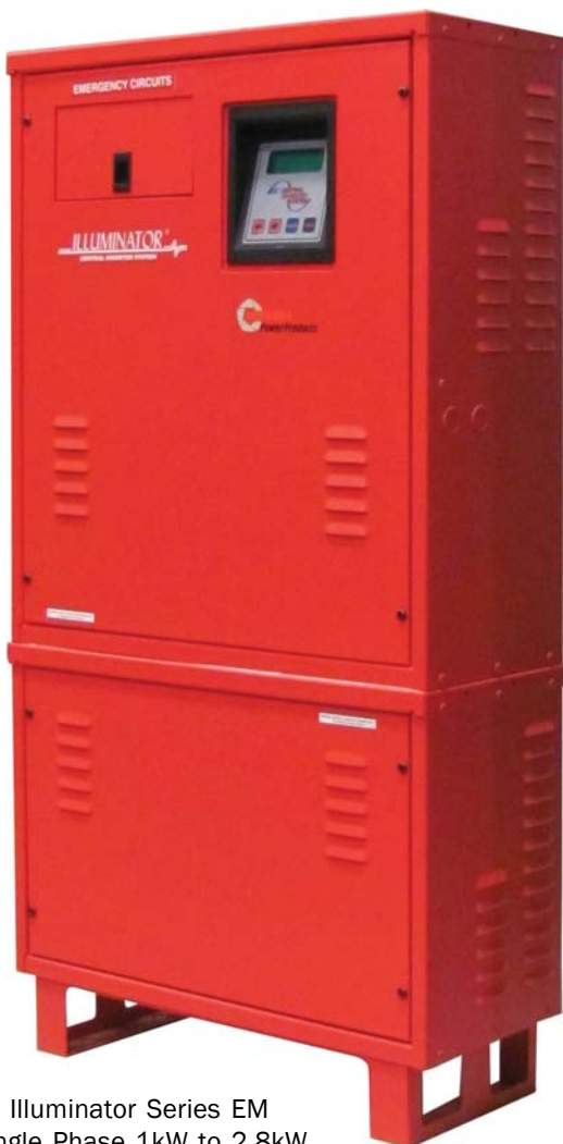
Illuminator Series EM Single Phase 1kW to 2.8kW (Shown with optional raised floor mounting bracket)