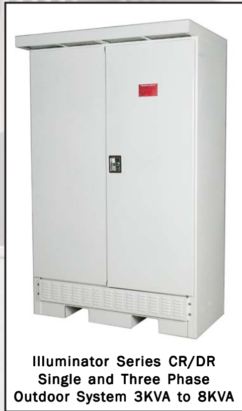
Illuminator Series CR/DR Single and Three Phase Outdoor System 3KVA to 8KVA