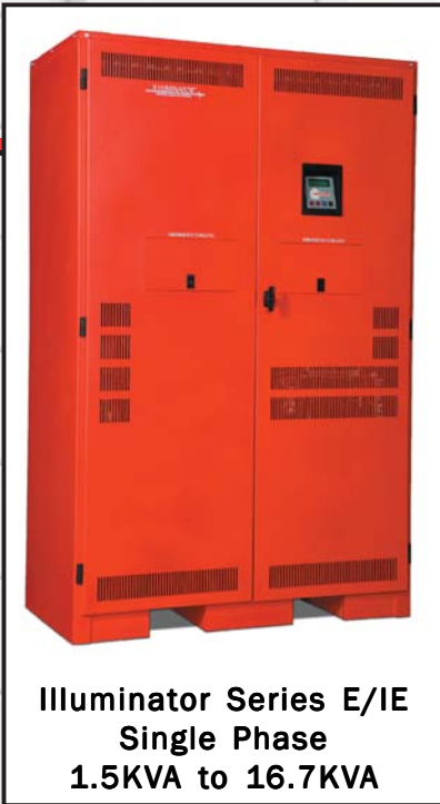
Illuminator Series E/IE Single Phase 1.5KVA to 16.7KVA